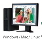
Windows / Mac / Linux*

The Xerox Phaser® 6270 Photobook Printer can be connected to systems that do not use MS, enabling network printing from a variety of applications.