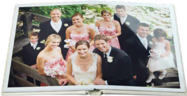
Photo albums in various sizes and outstanding thickness